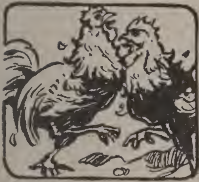
The Bad Rooster Got Into a Fight.

J ACK'S and Evelyn's favorite uncle had just arrived from Japan, and they had been begging him to tell them a story.